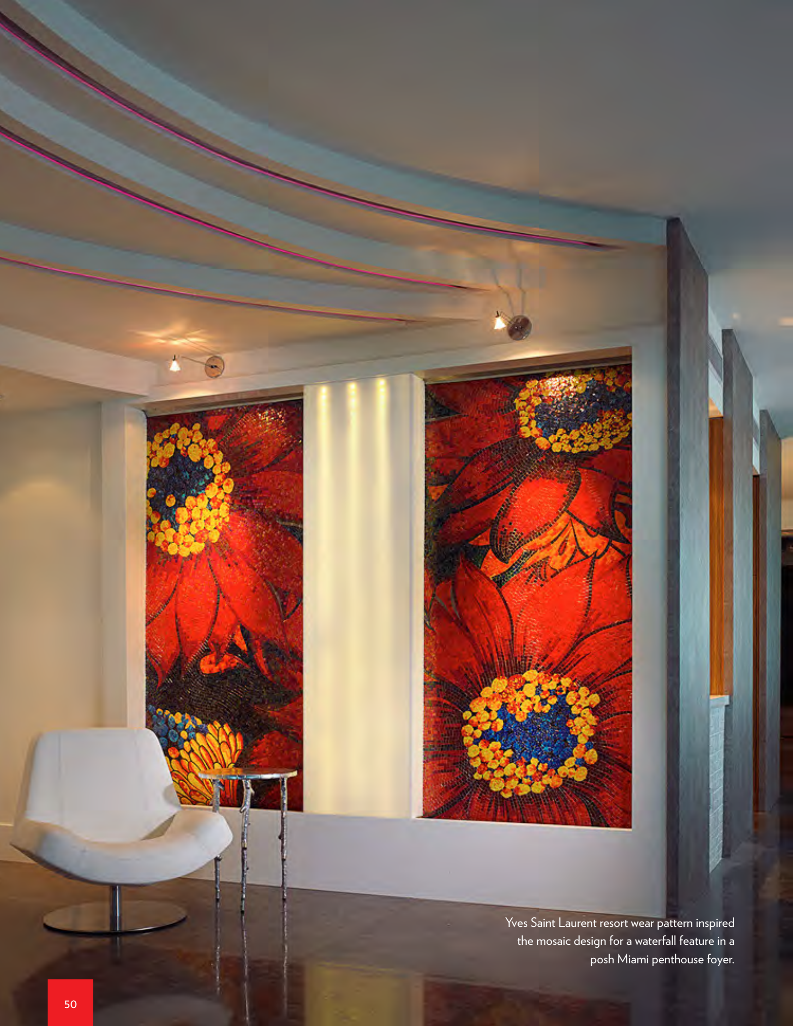
Yves Saint Laurent resort wear pattern inspired the mosaic design for a waterfall feature in a posh Miami penthouse foyer.